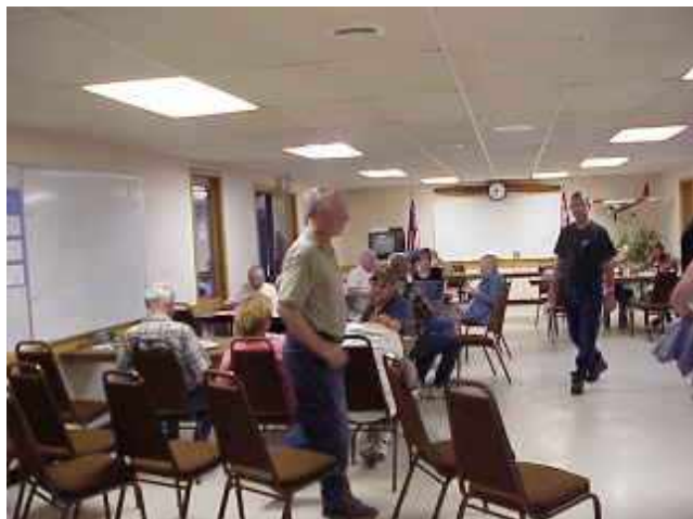
Some of the gathering before dinner.