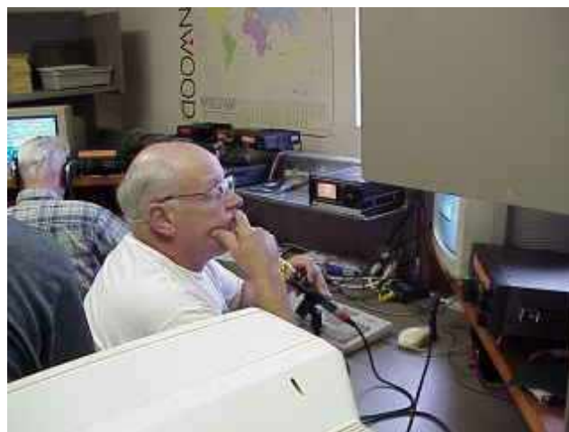
WE8Z wondering if he should make that call on 20m!